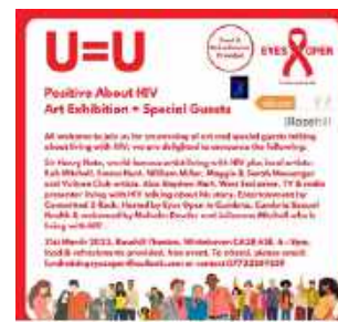
Cumbria artwork 21st March 2023