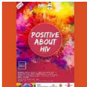
Northumbria artwork 18th March 2023