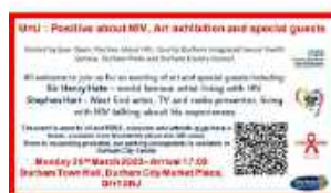
Durham artwork 20th March 2023