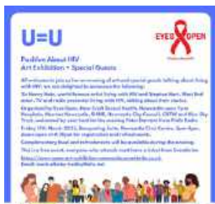
Newcastle artwork 17th March 2023

In March 2023, we delivered a series of U=U educational events which included art from professional and over 48 community artists, all living with HIV or connected to someone with HIV, we also had guest speakers and other community activities at the events to engage with our audiences, we also delivered info online.